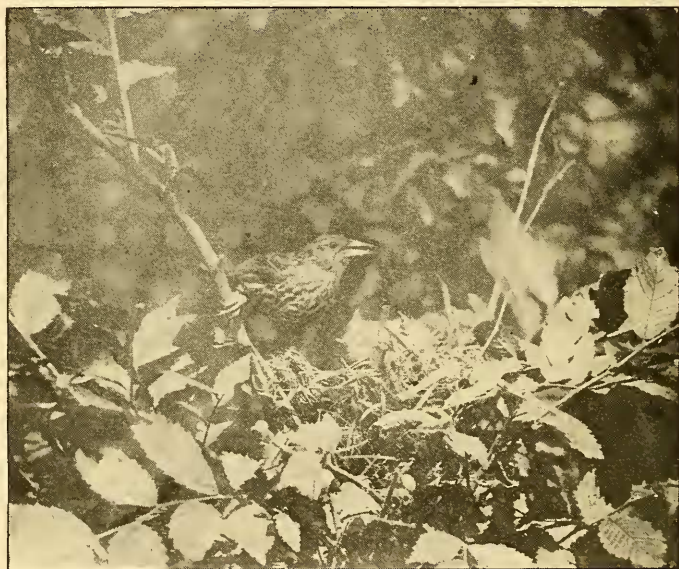
Female Alarmed by a Whistle from the Blind.

The nest was built in a small elm about two feet from the